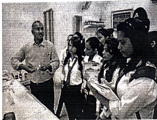
Students at IVRI.