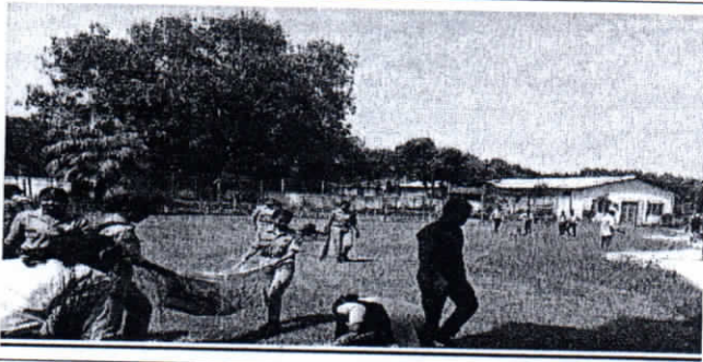
NCC Cadets in Cleanliness drive program 11-12-2022

The Cleanliness Drive conducted by the NCC unit adjoining invertis University was a resounding success in promoting cleanliness, environmental awareness, and community engagement. The commitment and active participation of students, cadets, and local residents played a pivotal role in achieving the desired outcomes. I extend my gratitude to the NCC unit, school/college administration, and all participants for their dedication and enthusiasm in making this initiative a triumph.