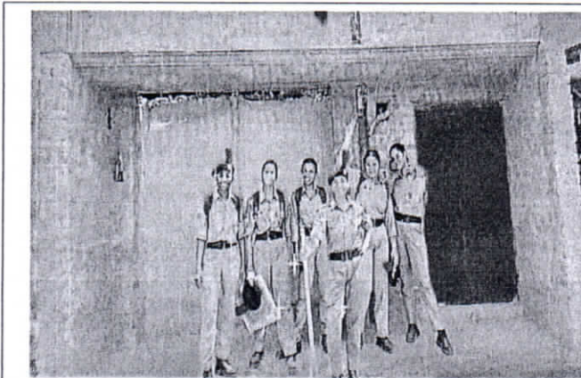
Students in Nukkad Natak 18-05-2022

The Nukkad Natak comprised 2 acts, each designed to address different aspects of drug abuse. Cadets had undergone rigorous rehearsals, resulting in impactful performances that resonated with the audience. The use of powerful dialogues, relatable scenarios, and vivid props effectively communicated the severity of the issue.