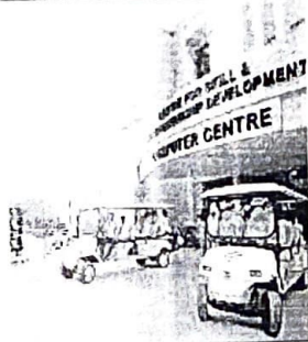
Eco-friendly carts for in campus drives 10 Nov 2022