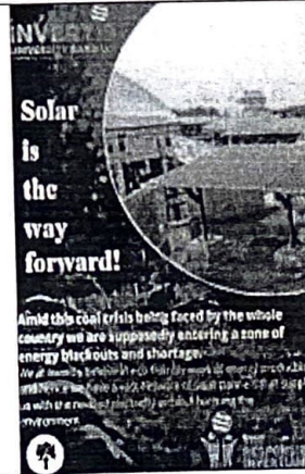
Promoting solar energy in eco-drive 10 Nov 2022