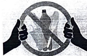
Posters for eco-drive 10 Nov 2022