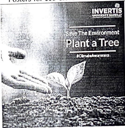
Plant a tree message for invertians 10 Nov 2022