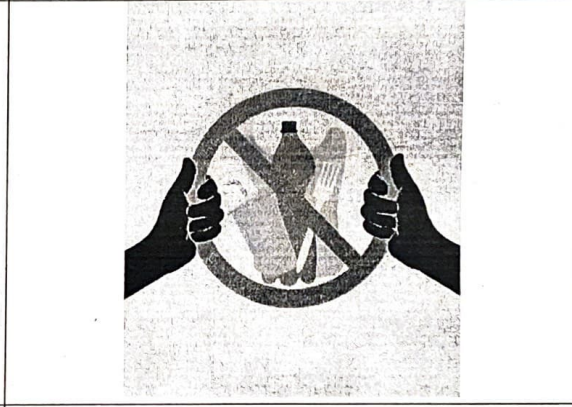
Posters used for the campaign