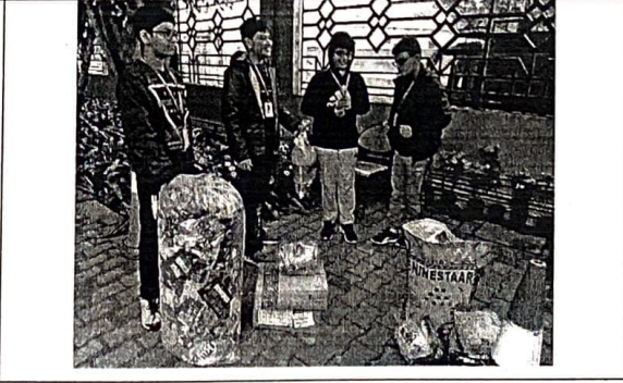
Plastic wrappers collected by participants