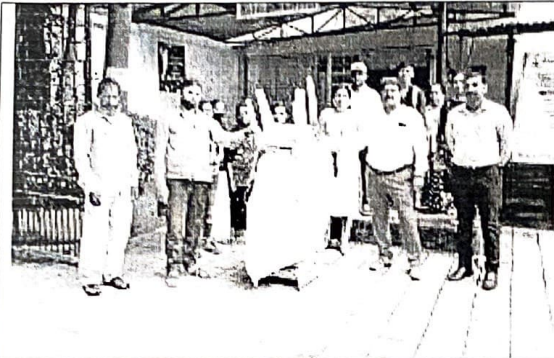
Plastic waste collected by faculty and staff