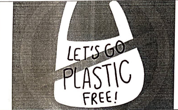
Posters used for the campaign