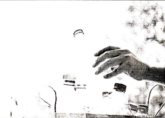
Plastic Bottles being collected