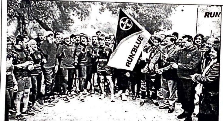
Volunteers and Student during the Nukkad Natak 31/03/2019

The Responsible Invertian club have organized one day save water awareness campaign in order to aware people of Bareilly regarding water preservation. The maino f the event is to ensure survival and improved outcomes for every child with safe and secure drinking water for all. A safe water supply is the backbone of a healthy economy, yet is woefully under prioritized, globally. It is estimated that waterborne diseases have an economic burden of approximately USD 600 million a year in India.