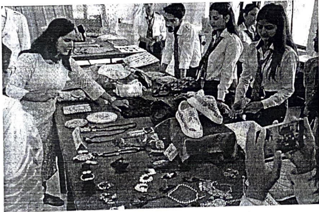
Students and faculty at the exhibition.

Description: The Department of Fashion Design organized an exhibition Reclaimed Threads: Where Creativity meets Sustainability on the 3 rd of April. With a focus on up cycling, repurposing, and eco-friendly practices, Reclaimed Threads aims to bring change in the way fashion is viewed by people all around by showcasing the limitless possibilities of sustainable fashion. The students made items of home decor, clothing and fashion accessories using old and used material. The exhibition was a show against fast fashion and its poor effects on the environment.