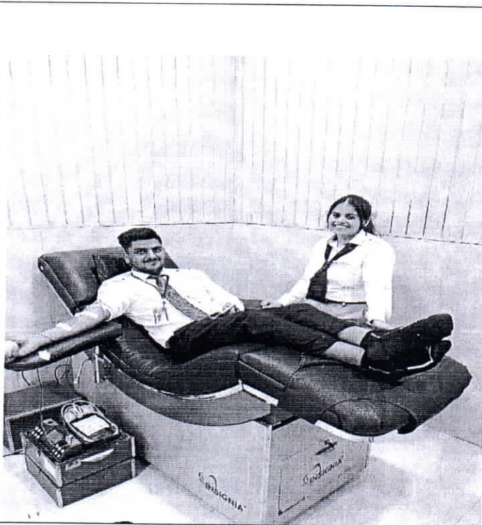
Mayor, Bareilly Donating Blood 27/03/2019

It was an extraordinary event that defied conventional limits. Through the profound dedication, unwavering enthusiasm, and boundless compassion, the Invertians breathed life into the hopes and dreams of countless individuals, endowing them with a renewed lease on life. This remarkable endeavor serves as a shining testament to the power of unity, empathy, and the valuable impact that a single act of kindness can have on the lives of many.