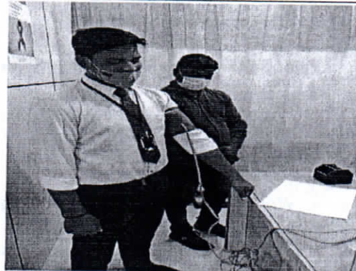
Student's Pre-Test at Mission Hospital 03-12-2018