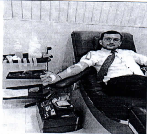
Student donating blood platelets03-12-2018