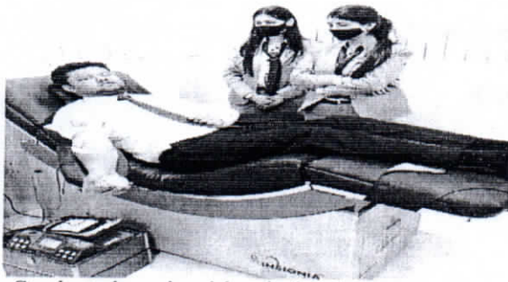
Student donating blood platelets03-12-2018