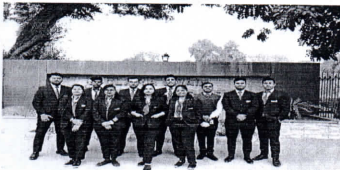
Students after blood platelets donation at Mission Hospital03-12-2018